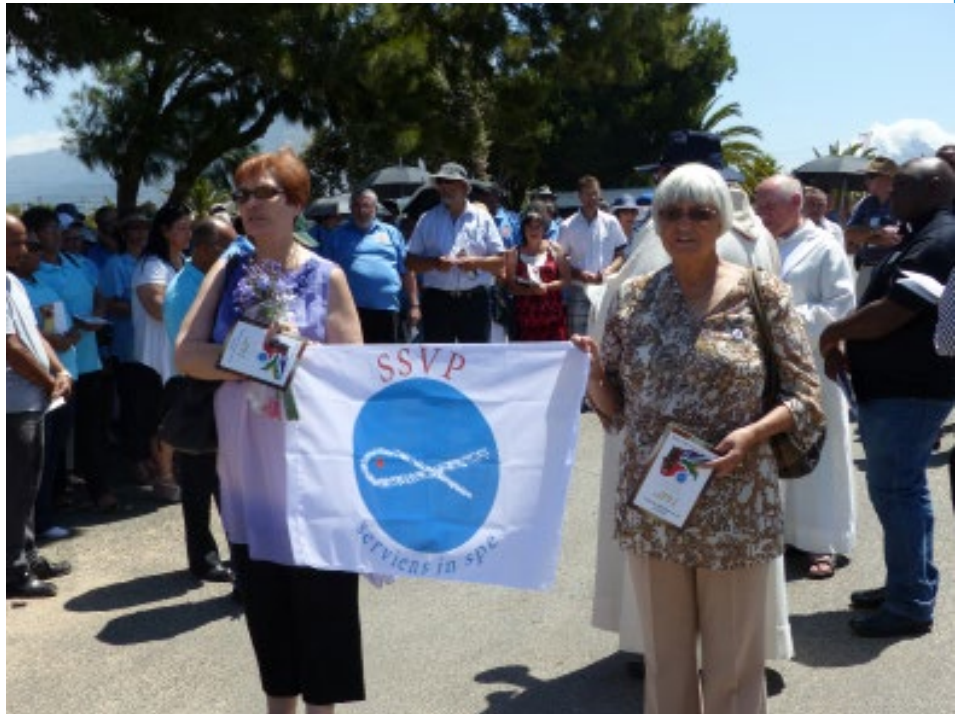
Celebration of the 160th anniversary in Cape Town

The core of SSVP work in South Africa has always been home visiting and helping the people in need. This help is given in the form of programs directed to vulnerable groups like the children and students in need, elderly people, homeless people, young single mothers, and so on and so forth. In specific terms, these projects are delivered in numerous ways: community shops, soup kitchens, drop-in centers, student grants, etc., and as it is everywhere, the Society