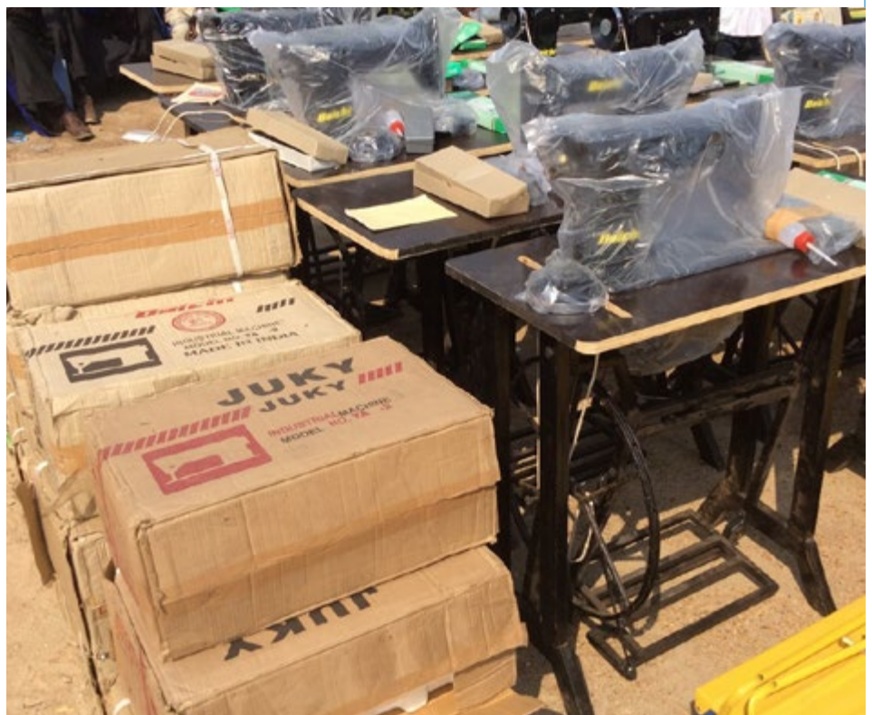
Tools for the qualified students