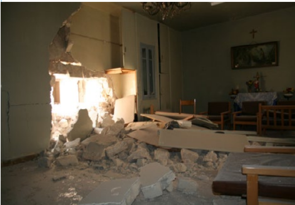
OAP nursing home -Aleppo

In Aleppo, the number of people is decreasing. The Society of Saint Vincent de Paul has no more than 12 conferences and 70 members. There were 125 members before the war broke out. As Joseph Ahmar Dakno, President of the Aleppo Council sets out, the city has been object to numerous massacres and acts of destruction. "It is impossible to describe the destruction, enormous destruction of housing, industry, factories, infrastructure, schools, mosques, churches due to large-scale shelling, but also killings. The OAP nursing home was bombed a few months ago and has become